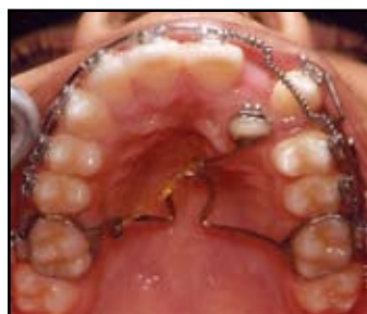
715 Transposed Canine