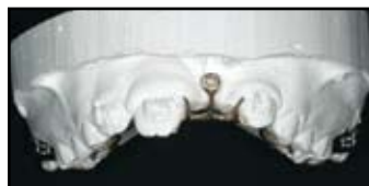
709 Dilacerated Incisors